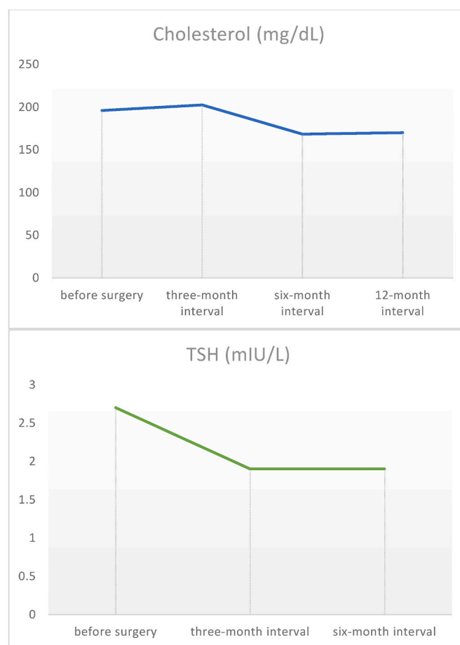
Fig. 1. (continued).